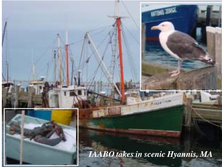
IAABO takes in scenic Hyannis, MA