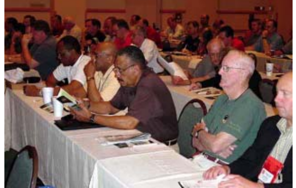
Full House at committee meetings.