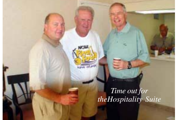
Time out for the Hospitality Suite