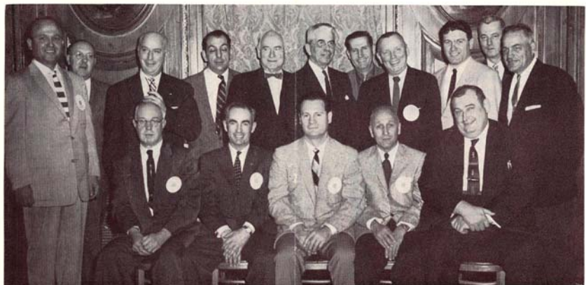
OFFICERS AND EXECUTIVE COMMITTEE I. A. B. O.

Extracted from Vol. 9, No. 68, February 1959